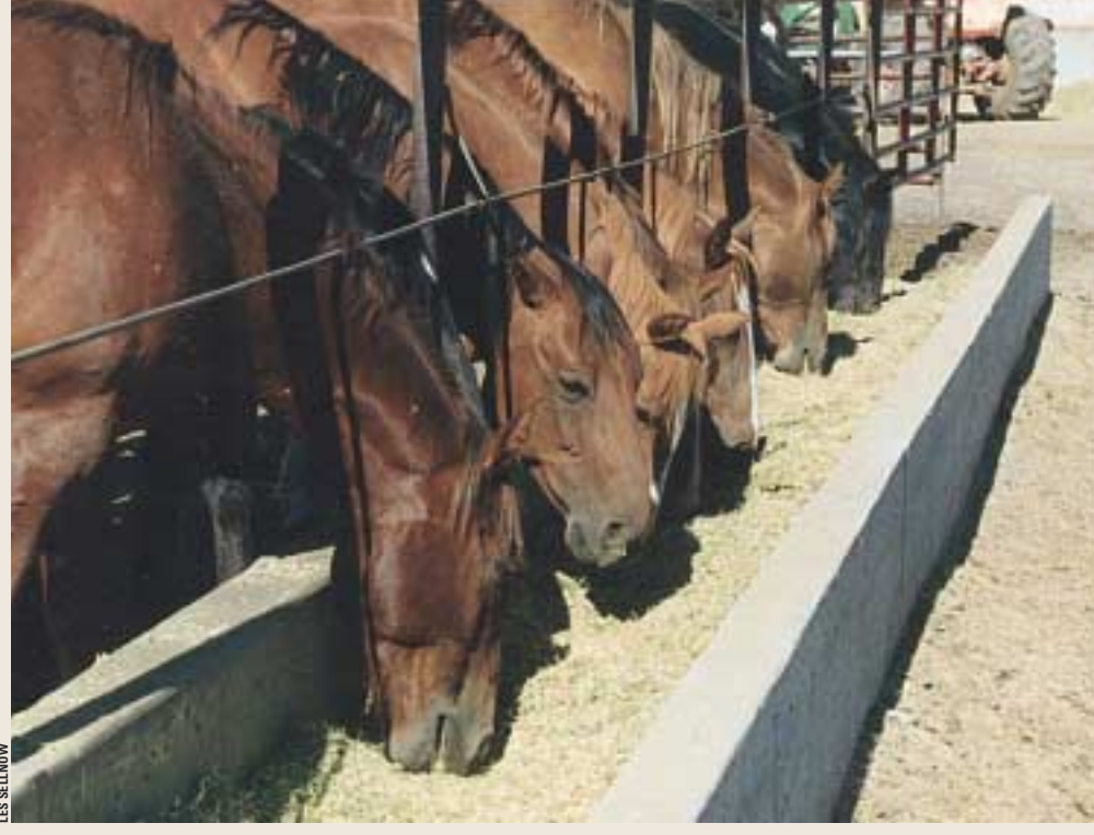
The main concern should be to keep Thoroughbreds from being mistreated

ments is "where would all the horses go? Our concern is to keep them from being mistreated." We believe these arguments to be mistaken, sometimes cynical, and occasionally surreal. We'd like to have a look at the arguments of the pro-slaughter forces from several points of view: I. STATISTI-CAL, II. LOGICAL, III. CULTURAL, and IV.